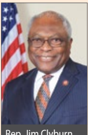
Rep. Jim Clyburn

As the threat of Christian nationalism has grown more visible in U.S. politics in recent years, NETWORK has vocally denounced the movement, as have other religious groups. The Baptist Joint Committee for Religious Liberty (BJC) is one of them.