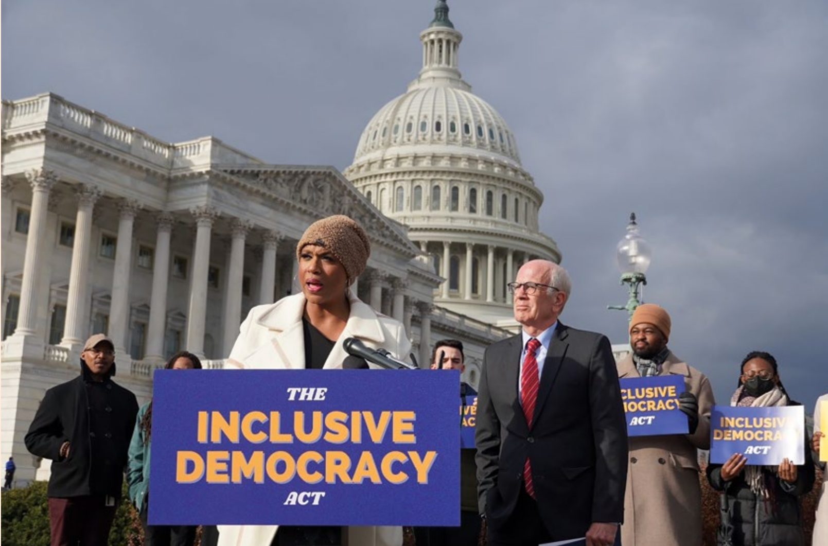
Rep. Ayanna Pressley of Massachusetts speaks outside the U.S. Capitol on Dec. 6 as she and Senator Peter Welch of Vermont introduced the Inclusive Democracy Act. The bill seeks to end felony disenfranchisement, a measure that disproportionately keeps Black and Brown people in the U.S. from voting.