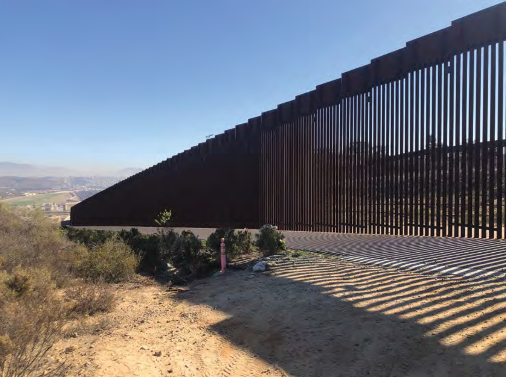
This is the wall at the U.S - Mexico Border in San Diego.