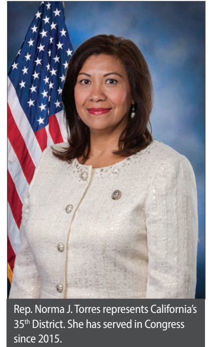
Rep. Norma J. Torres represents California's 35 th District. She has served in Congress since 2015.

Let us work to make our communities whole — the time to do registry is now.