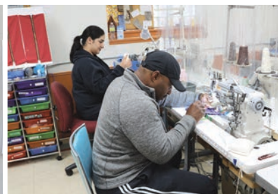
The NETWORK community learned about the challenges facing local families during site visits to Cristo Rey Community Center (Lansing, MI), Casa San Jose (Pittsburgh, PA), Working in Neighborhoods (Cincinnati, OH), and Esperanza Threads (Cleveland, OH).