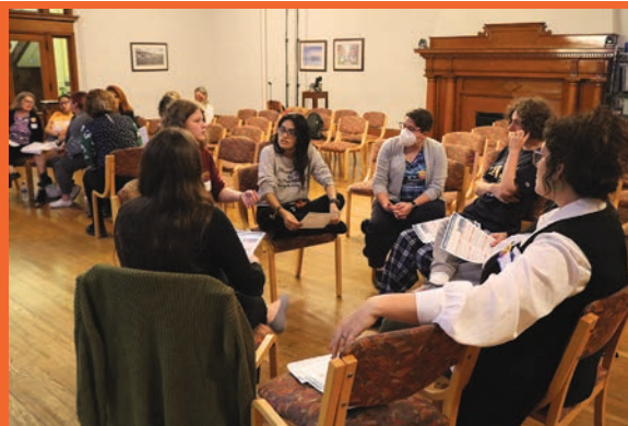
NETWORK organizers connected with the next generation of justice-seekers on college campuses, including Chestnut Hill College and University of Detroit Mercy.