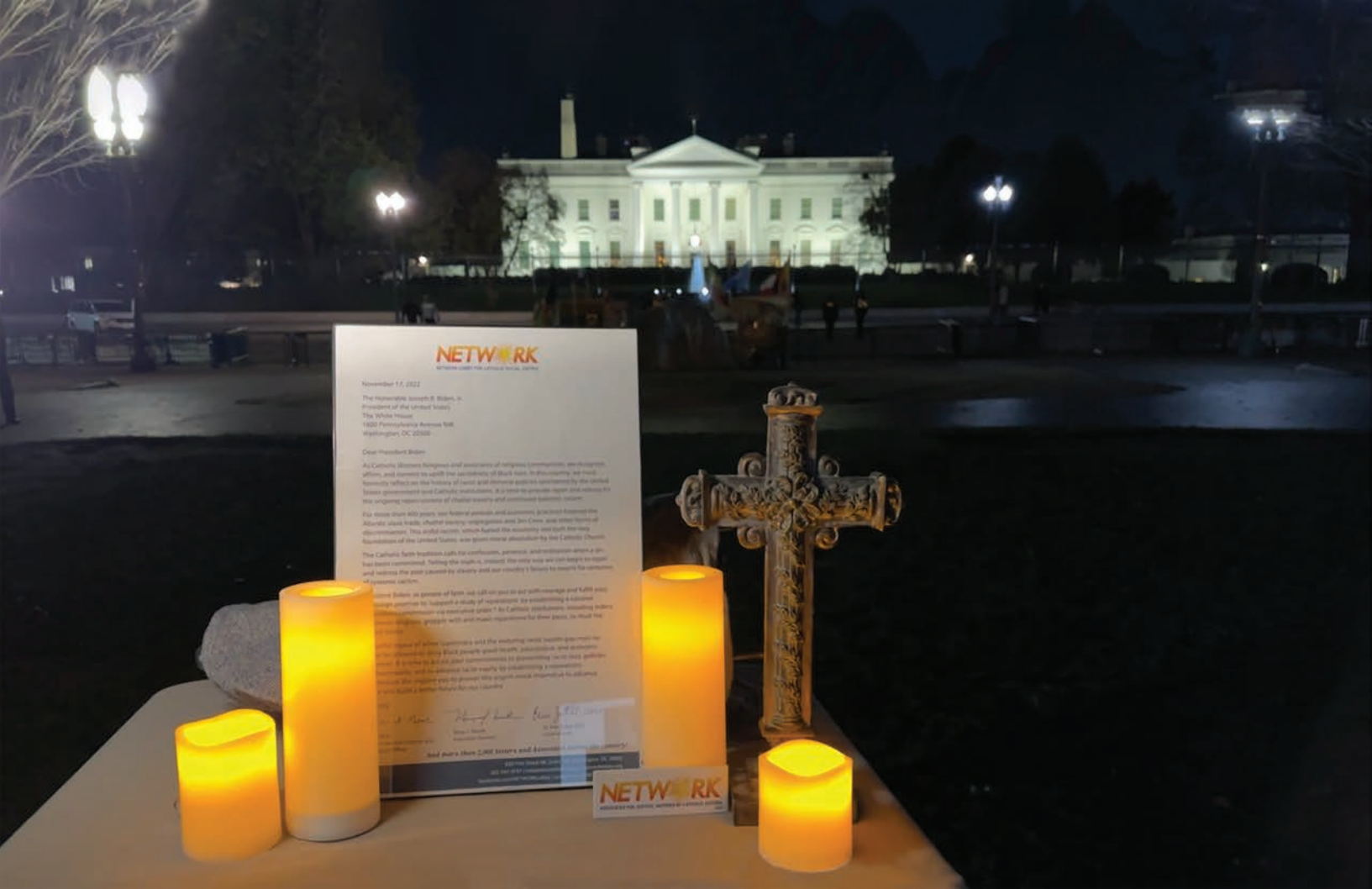
In November 2022, NETWORK delivered a letter to the White House calling on President Biden to establish a reparations commission via executive order. The letter was signed by more than 2,000 Catholic Sisters and Associates of Congregations of Women Religious.