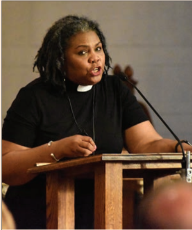
Rev. Traci Blackmon, Associate General Minister of Justice & Local Church Ministries for The United Church of Christ, speaks at NETWORK's reparations vigil in Cleveland.

first Black nuns had to establish their own congregations because they were not welcome. And it still makes me wonder, what happened to the dignity of all humans? You just don't know what to do with that sometimes."