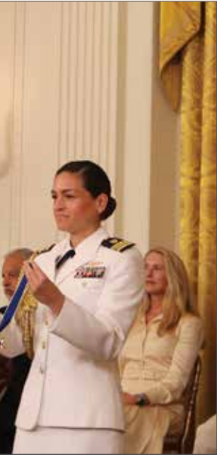
NETWORK's former executive and strong, Sister Simone NETWORK from 2004–2021, runs on the Bus tours. "She is the," Biden added.