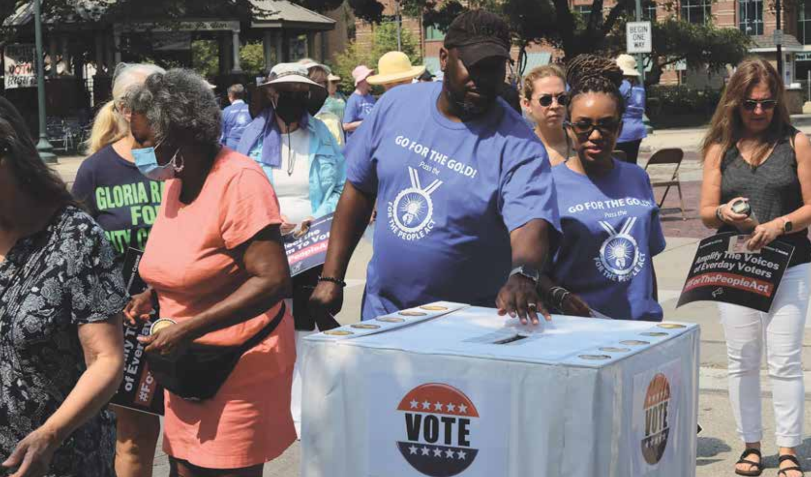
People cast their votes for federal democracy reform as part of NETWORK's "Team Democracy" events across the country in 2021. Voting rights, which have come under threat at the state level since the U.S. Supreme Court gutted the Voting Rights Act in 2013, are a key component of NETWORK's efforts to defend democracy.