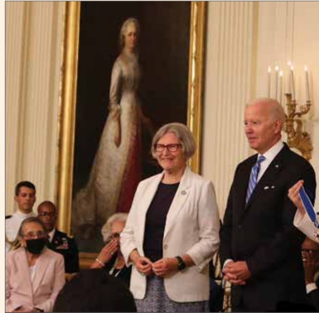
President Joe Biden presented the Presidential Medal of Freedom to National Shrine director, Sr. Simone Cambell, SSS. “Compassionate and brave, humble remains a beacon of light,” President Biden said of Cambell, who led the fight for the passage of the Affordable Care Act, and launched the National Shrine as an embodiment of a covenant of trust, hope, and progress for our nation.

MARK YOUR CALENDAR AND WATCH YOUR INBOX FOR REGISTRATION INFORMATION.