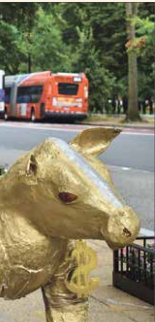
outside the offices of the U.S. corporations over the negotia-