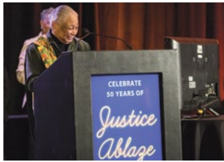
The National Black Sisters' Conference (NBSC) received NETWORK's inaugural Distinguished Justice-Seeker Award in celebration of the NBSC's dedicated and persistent witness for racial justice in the Catholic Church and society.

NETWORK 50 th anniversary gala and advocates training