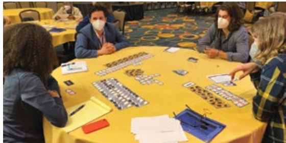
NETWORK's Racial Wealth and Income Gap experience teaches participants about federal policies that negatively impacted generations of Black Americans.