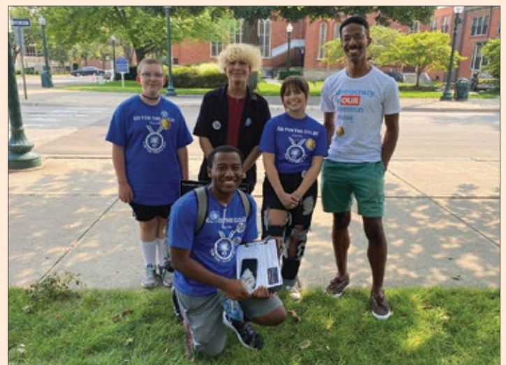
Justice-seekers organized and executed 20 "Team Democracy" events last year, engaging more than 400 people, including democracy advocates in Monroe, Michigan shown here.

Because racism is embedded into our society's systems and structures, we intentionally prioritize dismantling systemic racism and white supremacy in our political systems as well as our economic and social structures. To do this work for racial justice effectively, advocates must engage in ongoing development and learning about racial justice and regular self-reflection. NETWORK resources are available to equip you to do the work of racial and economic justice, organize in solidarity with people of color, and educate yourselves and others in your community about racism.