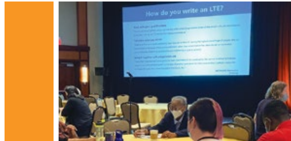
NETWORK advocates learn how to write compelling Letters to the Editor (LTEs).