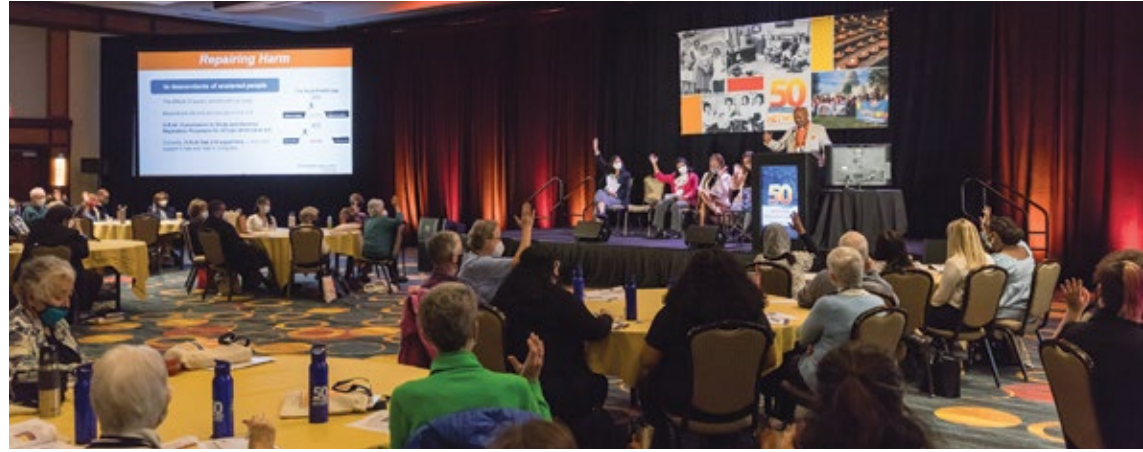
The NETWORK Government Relations Team educated Advocates Training attendees on the Build Anew Agenda to kick off the three-day event.