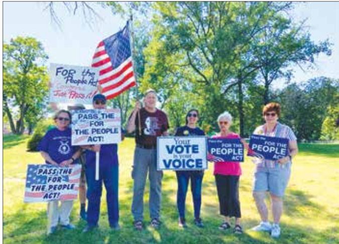
The Sisters of St. Joseph in Cleveland and the Cleveland NETWORK Advocates Team rally to protect the freedom to vote in Ohio.