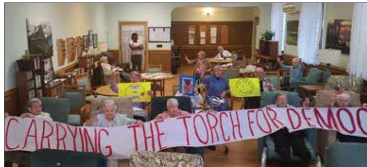
Sisters at the Sacred Heart Convent in Hempstead, New York carrying the torch for democracy.