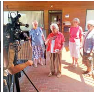
Sisters in Tucson, Arizona address the press after presenting a letter signed by thousands of religious women across the country to Arizona’s Senators Mark Kelly and Kyrsten Sinema urging the Senate to pass federal democracy reform.