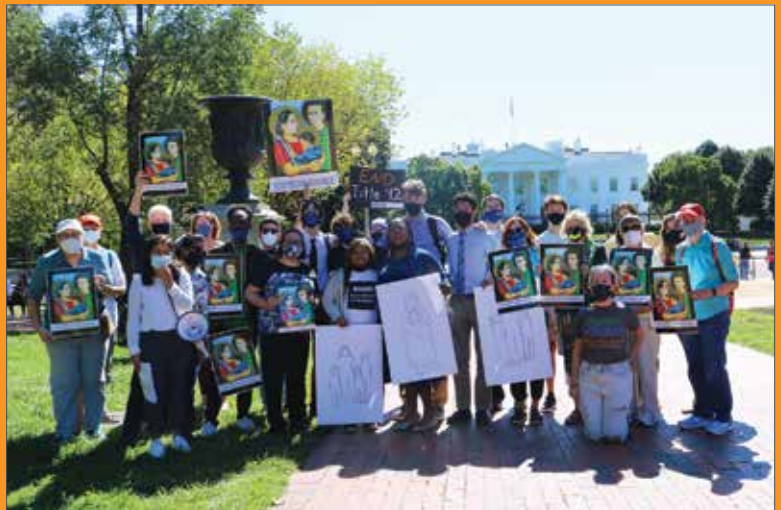
Activists gather outside the White House to call on President Biden to end the continued misuse of Title 42

Unfortunately, the Biden administration continues to support this immoral misuse of Title 42, which puts migrants’ lives at risk at our border.