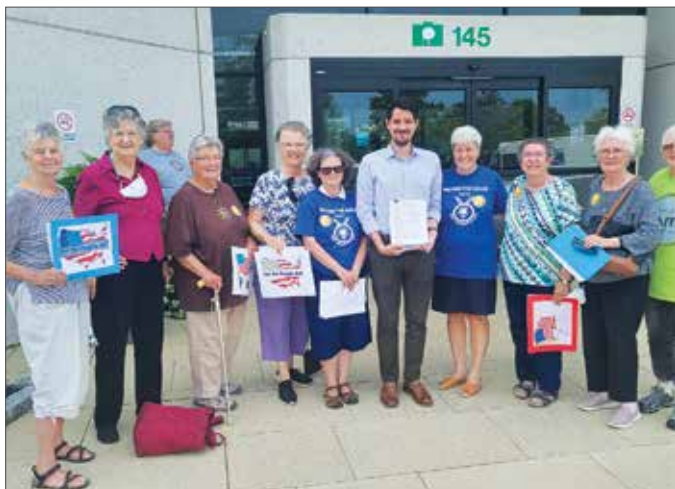
Sisters of St. Joseph of Brentwood deliver a letter supporting legislation to protect the freedom to vote signed by more than 3,685 Catholic Sisters to Senate Majority Leader Chuck Schumer's office in Long Island, New York.