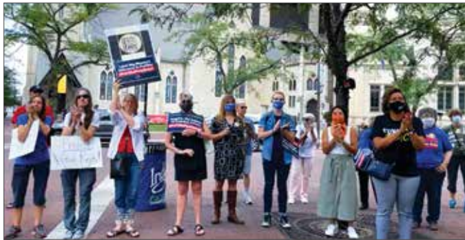
Indiana Catholic Sisters and broad coalition of other concerned Hoosiers host a "Carry the Torch of Democracy" rally at Monument Circle in Indianapolis.