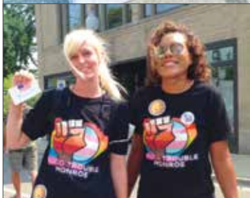
In Monroe, Michigan, the IHM Sisters and the Stronger Together Huddle organized a “Relay to the Ballot Box” where participants carried ballots and had to get through hurdles along the way to the ballot box near City Hall.