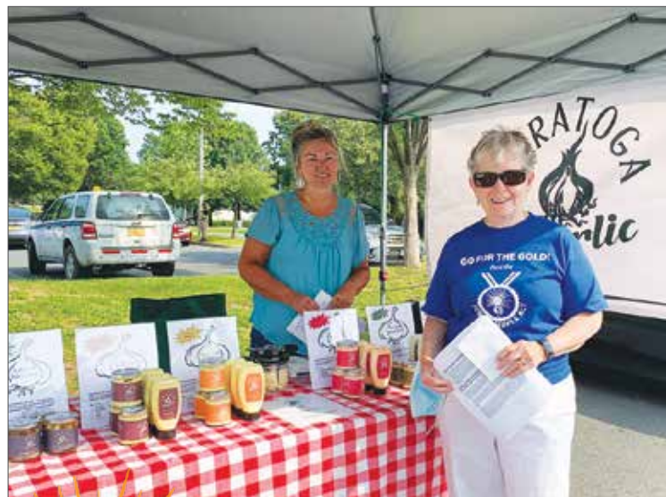
Virginia NETWORK Advocates Team members inform their fellow Virginians about federal legislation to protect the freedom to vote at their local farmers market.