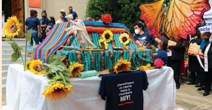
An altar honors essential workers and calls for a pathway to citizenship.

Whether workers are union members or not, access to paid family and medical leave is a necessity for every family. This recovery package provides a unique opportunity to finally pass a permanent, national paid leave policy. Universal paid leave must include job protection and anti-retaliation language, have an inclusive definition of family, and provide progressive wage replacement. Finally, this policy must center the needs, leadership, and expertise of women of color in its design, implementation, and evaluation to ensure just and equitable outcomes.