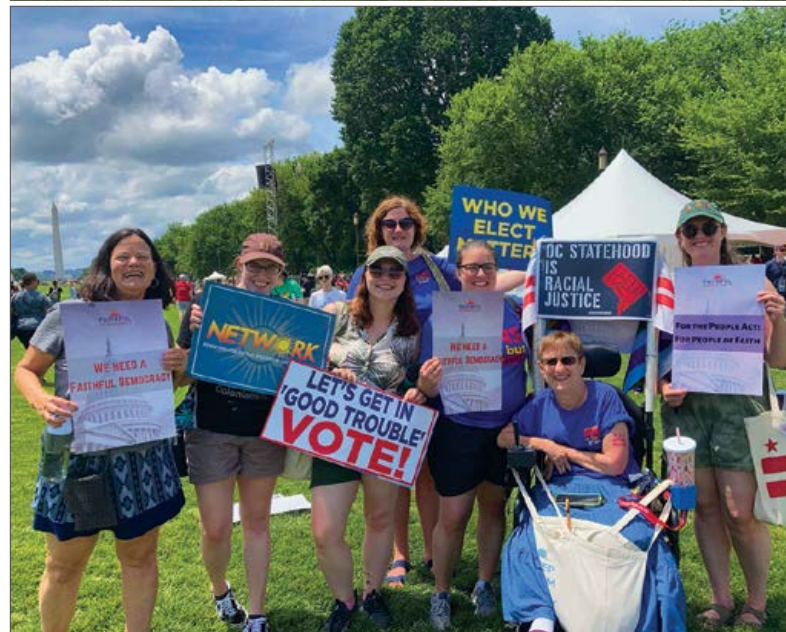
NETWORK staff and supporters attend the Black Voters Matter tour on the National Mall.