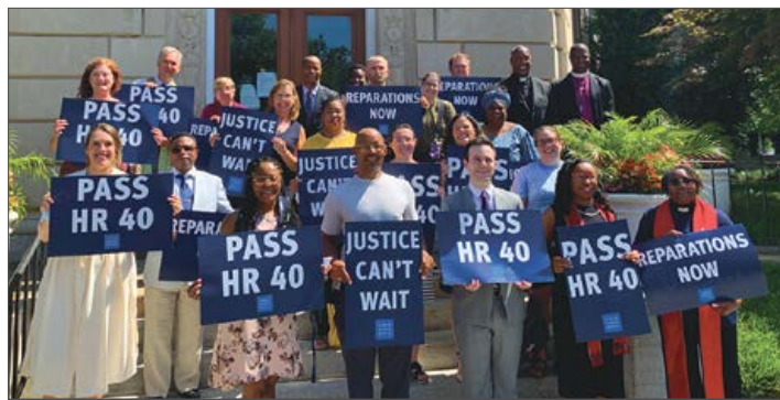
People of faith gather in D.C. to support H.R.40, establishing a Reparations Commission.