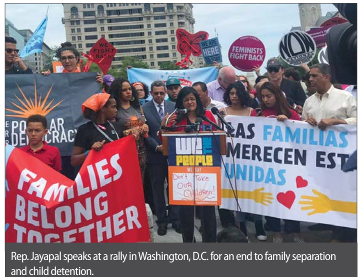
Rep. Jayapal speaks at a rally in Washington, D.C. for an end to family separation and child detention.

We must demand that Trump fix the crisis he created, and reject his false claims that he has taken any action to do that. The executive order he signed does not reverse his zero-tolerance policy that created these abuses and violations; instead, it allows for the indefinite detention of children and their parents in family prison camps. His administration has challenged a previous court settlement that clearly states that children cannot be detained for more than 20 days. That means that, very