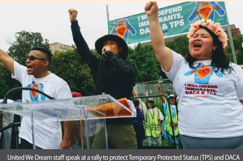
United We Dream staff speak at a rally to protect Temporary Protected Status (TPS) and DACA