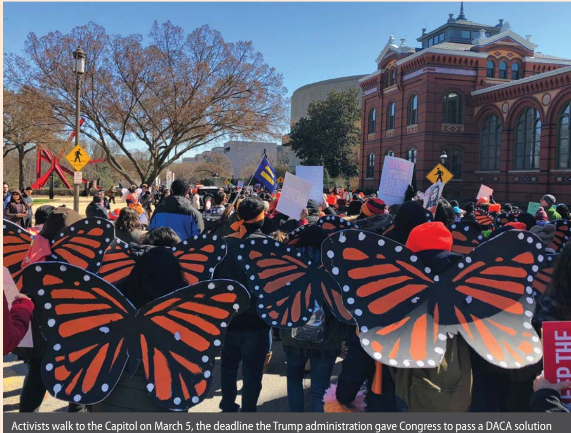
Activists walk to the Capitol on March 5, the deadline the Trump administration gave Congress to pass a DACA solution