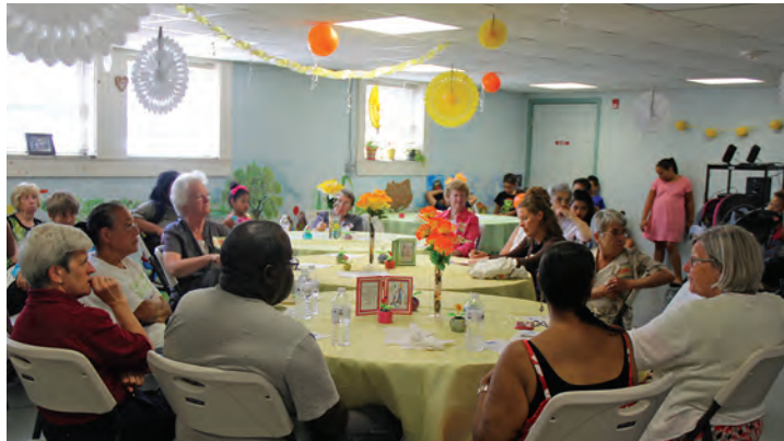
Guests and staff at McAuley Ministries share their stories with the Nuns on the Bus.

Taken from NETWORK Lobby's Joy of the Gospel Election Reflection Guide