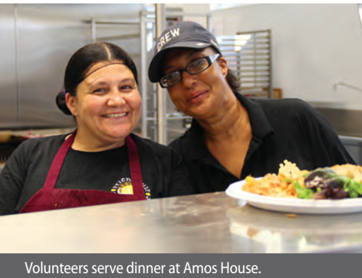
Volunteers serve dinner at Amos House.