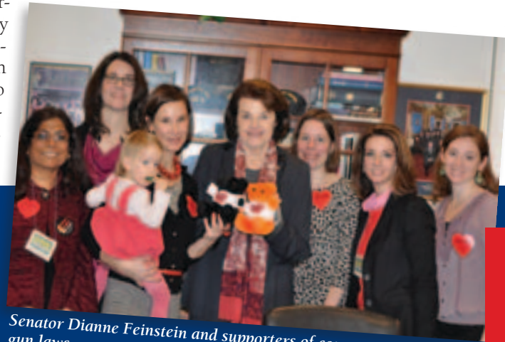
Senator Dianne Feinstein and supporters of commonsense gun laws.

suffering—sites where children have been shot, or courthouses or gun dealers. Other sites could be places offering children help and support, such as a Head Start program or a place of worship. At each stop, a different religious leader could offer brief, powerful information about the suffering of children from gun violence and poverty, a reading from a sacred text, and a prayer.