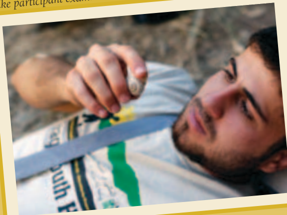
Hike participant examines a shell he found.

have the opportunity to help her peers in Iraq overcome the difficulties in their pasts and pursue their dreams of a brighter future.