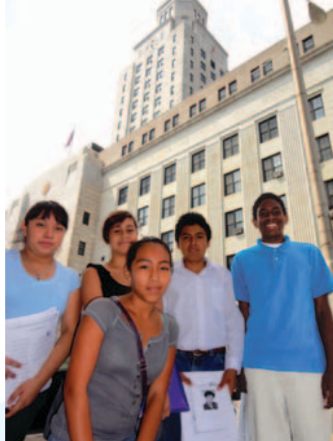
Student Leaders, after giving a presentation at the Camden City Mayor's Youth Council at City Hall.

Our community has become involved, too. In our March meeting with officials, many of our neighbors, whom we have never seen, came and supported us. Also, on Martin Luther King Jr. Day, we showed children who live in our