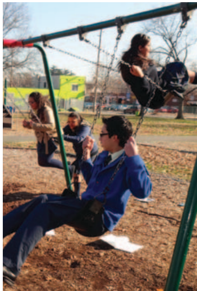
Youth advocates enjoy swings they got the county to refurbish. They were participants in the Student Leaders' Von Nieda Park Task Force summer program, sponsored by their school, St. Anthony of Padua in Camden, New Jersey. See story on page 12.

cal decisions facing our nation regarding gun violence, the budget, immigration reform, climate, etc., we hold the needs of our children's children at the heart of our concern. If we make decisions that will benefit them, then we will fulfill both our constitutional mandate and Christ's call. It will be for the good because the reign of God belongs to our children's children.