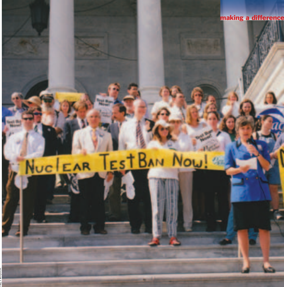
Author (in blue) speaks out at nuclear test ban treaty demonstration in front of U.S. Capitol.

When I first came to NETWORK as an Associate in 1998-99, I was involved in an arms-control coalition that was lobbying for ratification of the nuclear test ban treaty. We lost that one, and I'm still hoping that the Comprehensive Test Ban