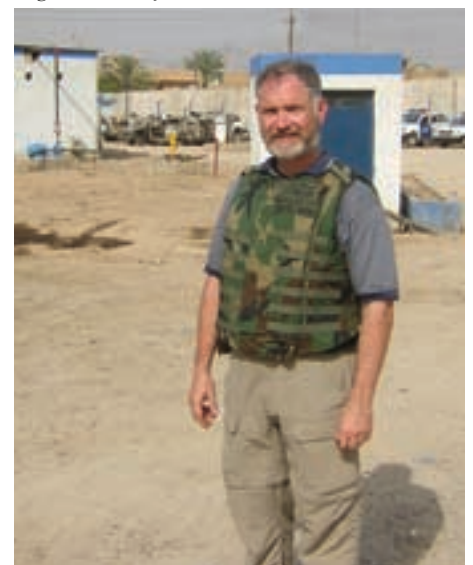
BELOW: Author at the Bayaa police station in Baghdad on May 11, 2005.