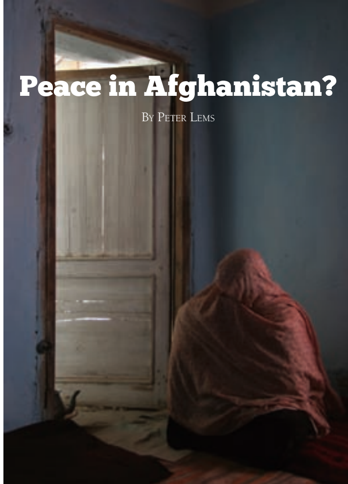
An Afghan widow sits near the door to her tea room.

Additional peacemaking efforts will need to address legacies of past wars, poverty, tribal and ethnic conflicts, and a drug trade that now accounts for one-third of the economy. It is a challenge that will require the participation of all significant parties to the conflict.