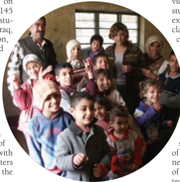
Iraqi children.

In the past few years, bombing has damaged many buildings, including our schools and convents. This was a very difficult time. As mentioned, young Sisters had to leave the motherhouse in Mosul for safer places. Sisters attending universities were required to wear the hijab and could not wear any Christian symbols such as habits or crosses. Still