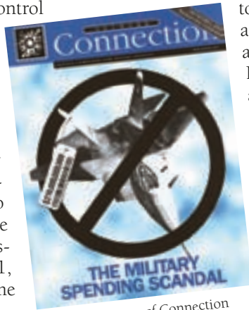
A 1997 issue of Connection addressed military spending.