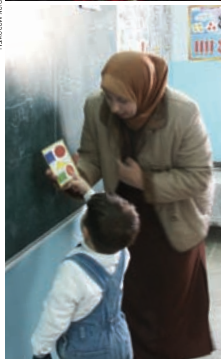
A hospital (above) and a classroom in Iraq.

Jordan to assist a group of Iraqi women religious.