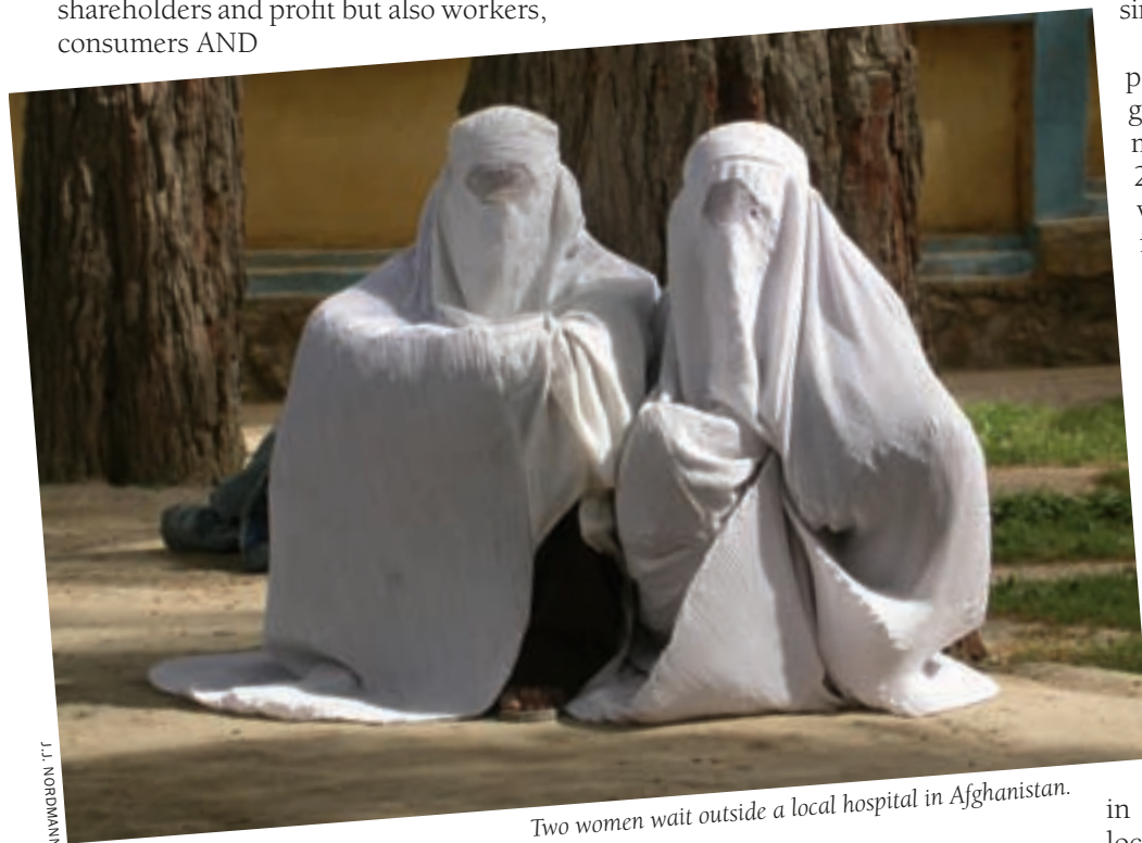
Two women wait outside a local hospital in Afghanistan.