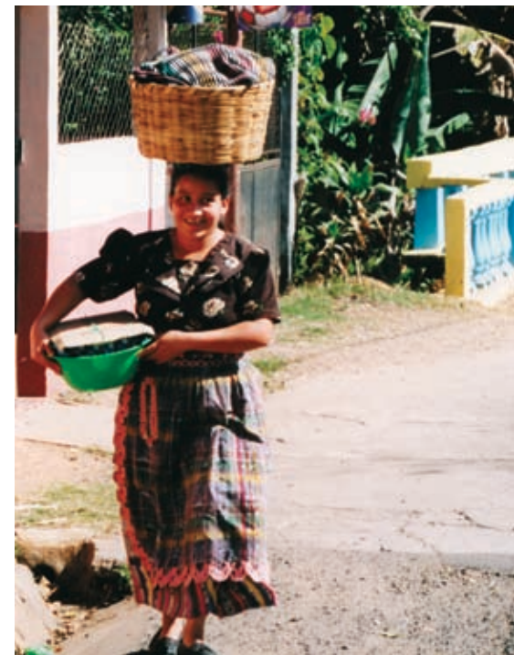
Returning from the morning market.