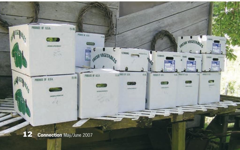
Below: Boxes of freshly harvested broccoli, collards, and sugar snap peas, ready for delivery. Below right: A local farmer at work in the field.

After completing my initial work in the area, I wanted to better understand local food from the producers’ standpoints. Last summer, I returned and worked with three farmers who grow produce for their own families as well as for COG. I delivered boxes of freshly harvested collards and broccoli to COG and was delighted when I spotted them beautifully displayed during subsequent trips to local grocery stores. When I saw them, I looked down at the dirt entrenched beneath my fingernails, smiled, and walked away understanding where it all began.